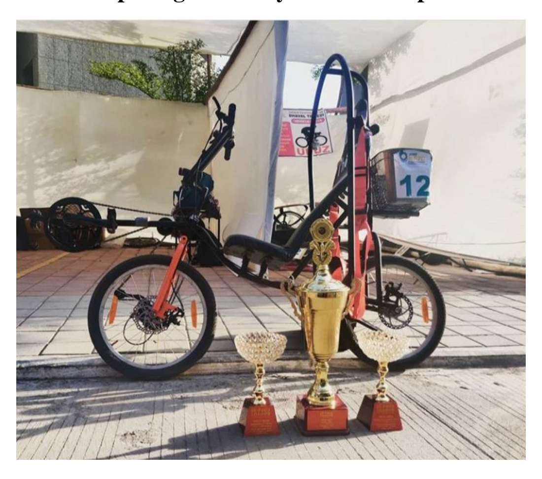
Team Photon at ASME Human Powered Vehicle Challenge 2020