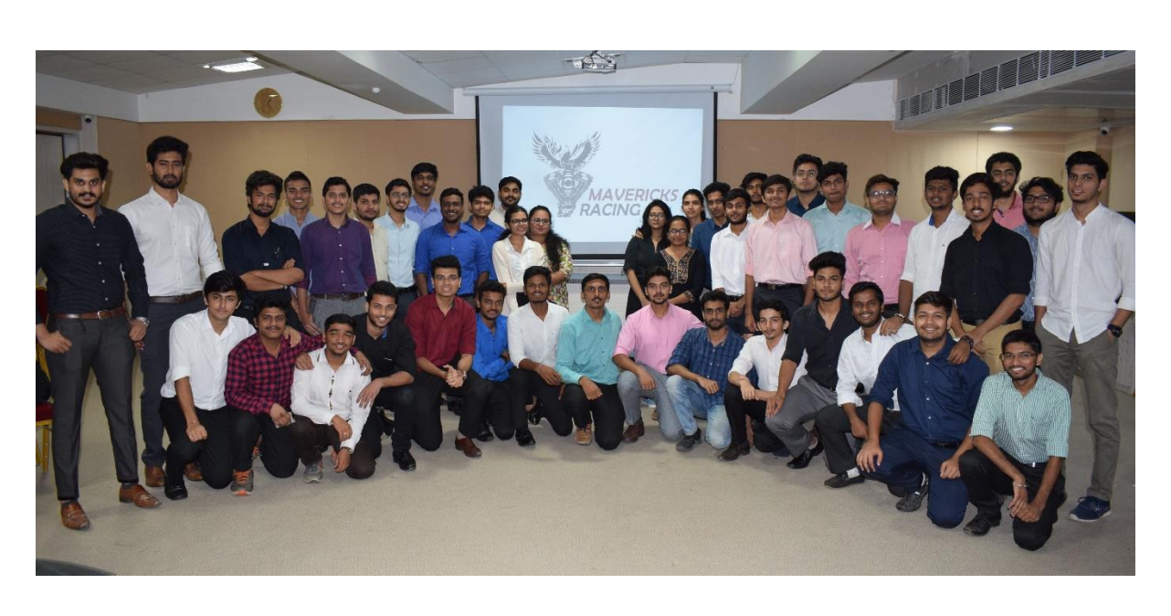
Students of Team Mavericks Racing at Campus Mentorship Programme by Formula Imperial 2020