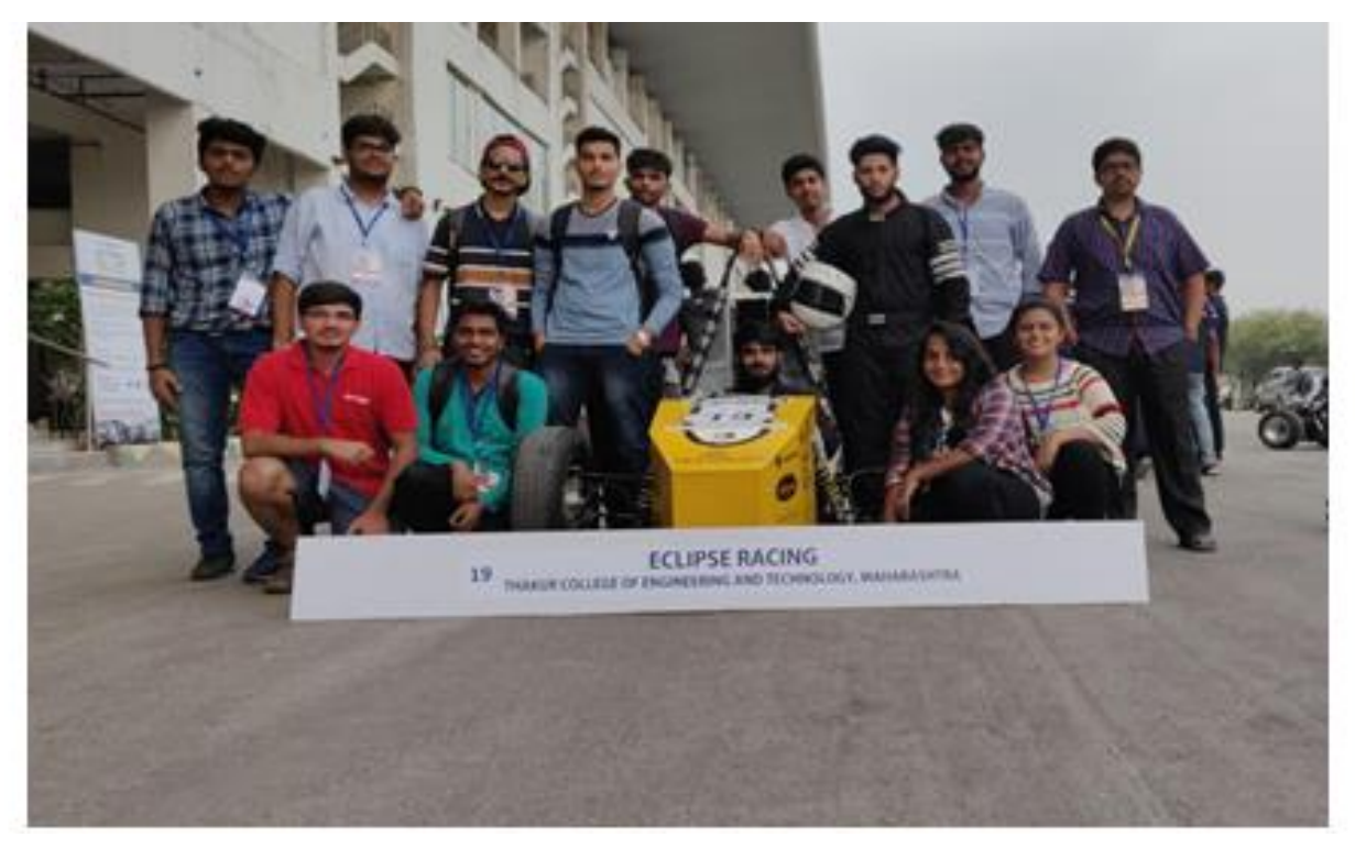
Students Team Eclipse Racing at SUPRA SAE India 2019 (Buddh International Circuit, Greater Noida (U.P.)