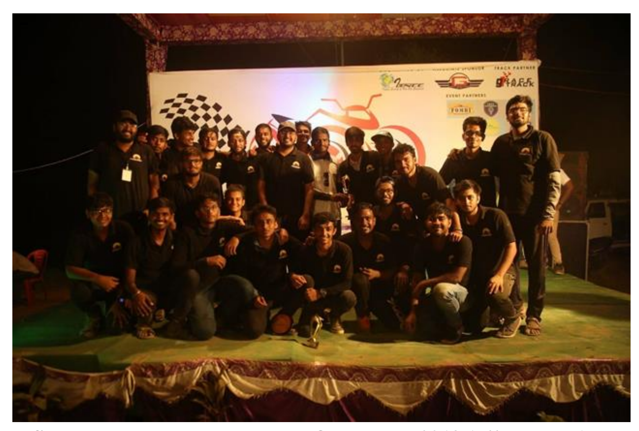
Students Team Technocrats at Quad-Torc 2019 (Bijnor, U.P.)