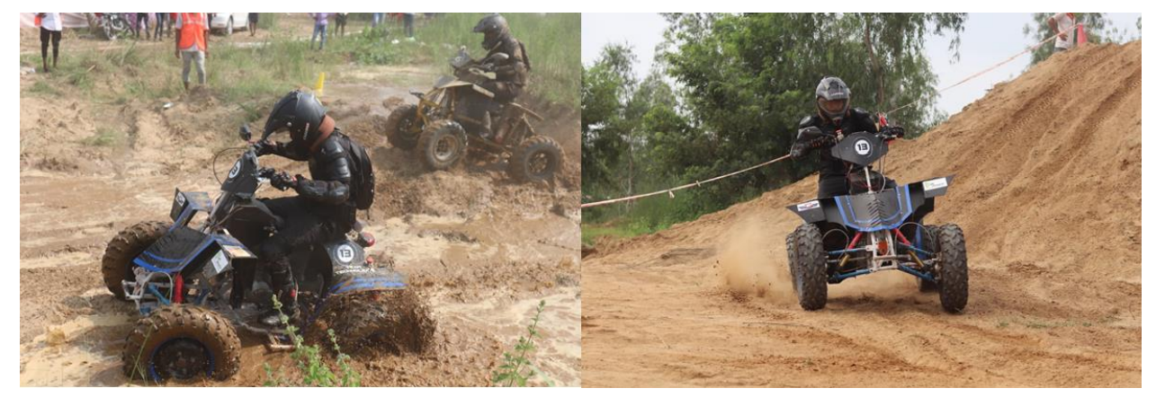
Glimpse of Quad-Torc 2019 (Bijnor, U. P.)