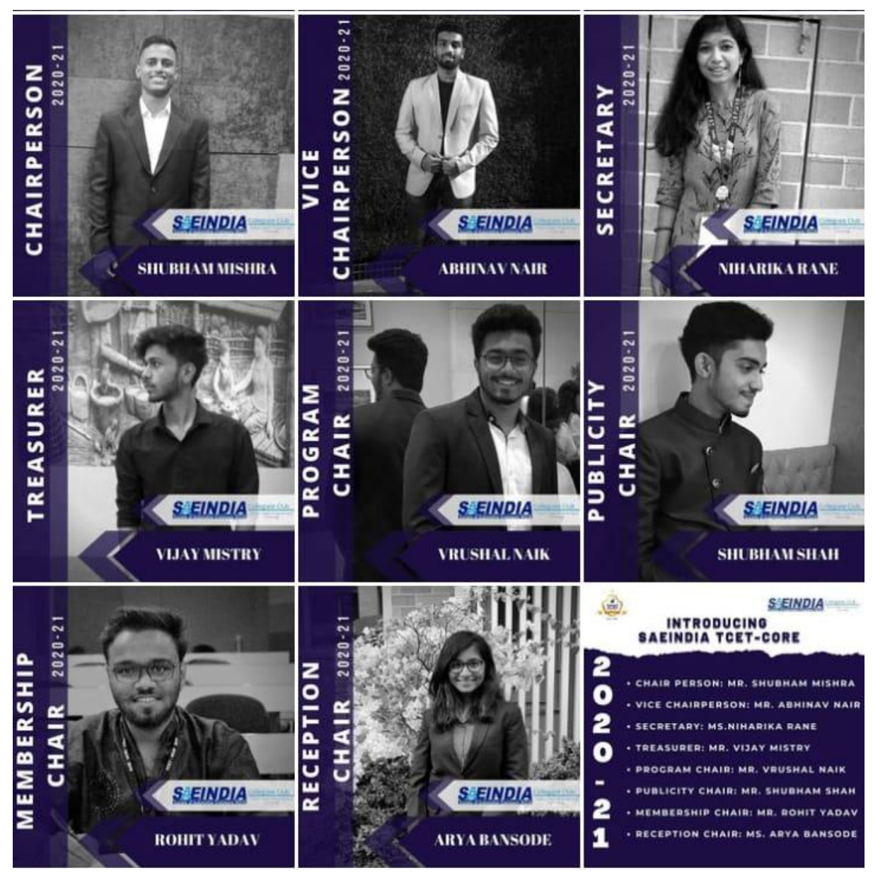
SAE India – TCET Working Committee (A. Y. 2020-21)