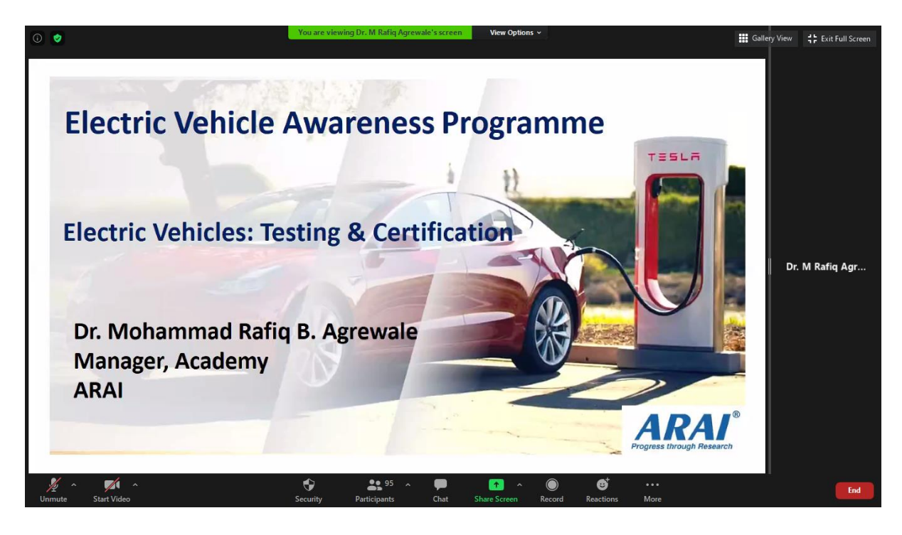
Glimpse of One Day Electric Vehicle Awareness Online Programme