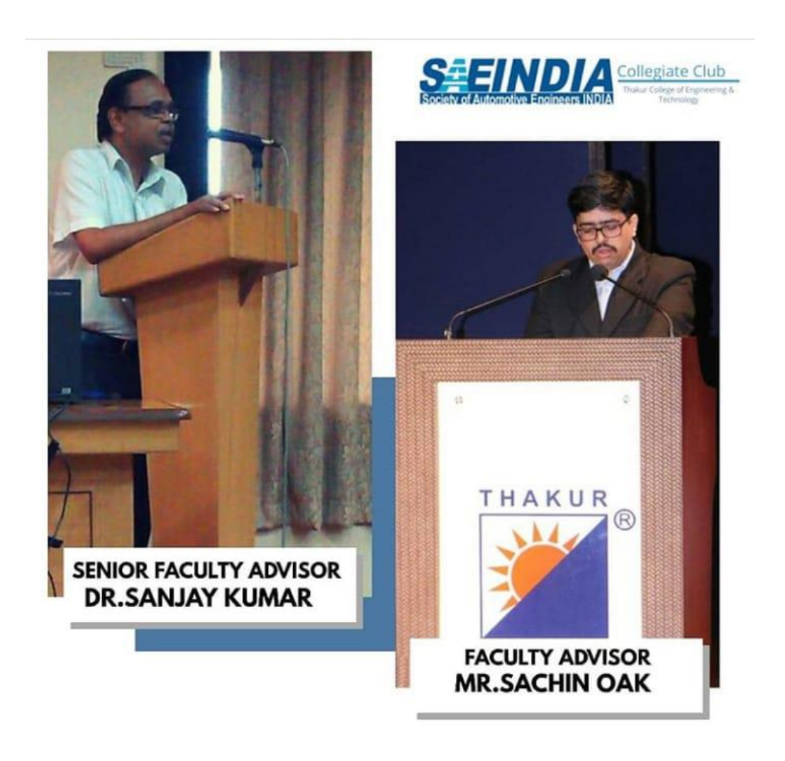
SAE India – TCET Faculty Advisors